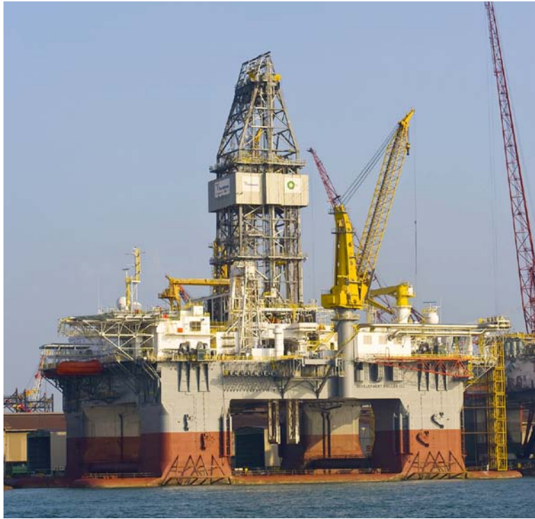
The Development Driller III rig that was chosen to drill the relief well is similar to the Deepwater Horizon .