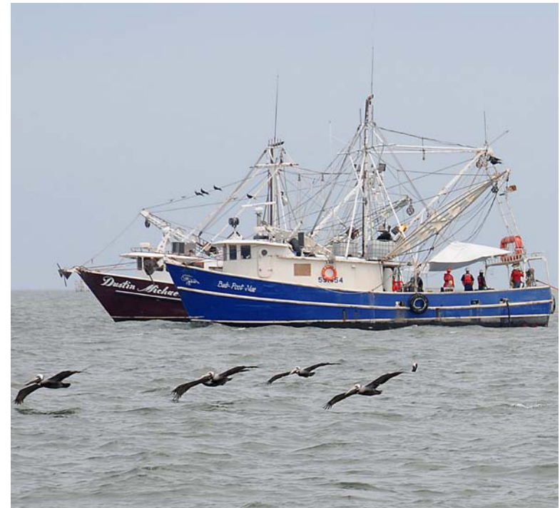
Shrimping boats put out of work by the oil spill help with the cleanup effort.

Many coastal towns rely on oyster beds, fishing, and the shrimping industry for jobs. Other towns have beautiful beaches and fishing areas that attract tourists and other people for recreation. All of these important parts of the Gulf Coast's economy can be severely damaged or even destroyed by spilled oil. The possible effect on the lives of people who live in the path of the spill is enormous. Some estimates put the damages to fishing and tourism from the Deepwater Horizon oil spill at more than $5 billion.