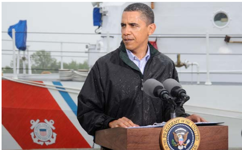
President Obama talks about the spill on May 2, 2010.