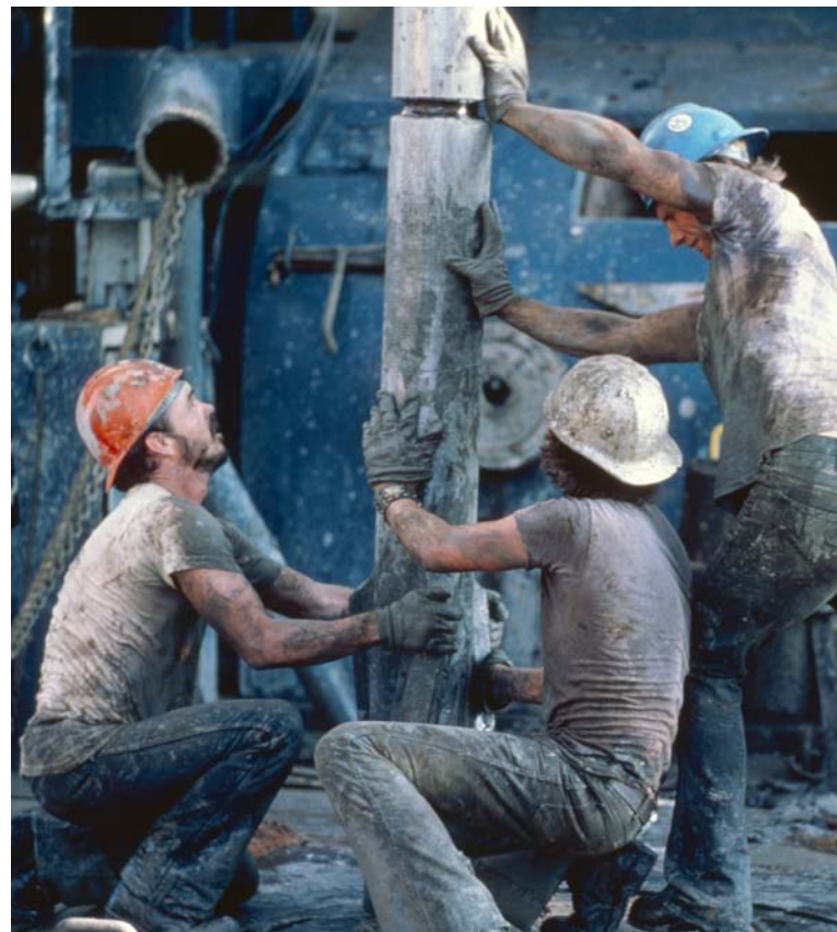
Crew members work on an offshore oil rig in the Gulf of Mexico.

As the first edges of the oil slick neared the Gulf Coast shores, another solution was tried. The idea was to build a large metal box to place over the leaking well. The oil that collected inside the box would be pumped out into tanker ships that would haul the oil away. Unfortunately, when this plan was tried, the box became blocked with frozen crystals of natural gas. The cold temperatures and high pressures at the seafloor kept the box from working.