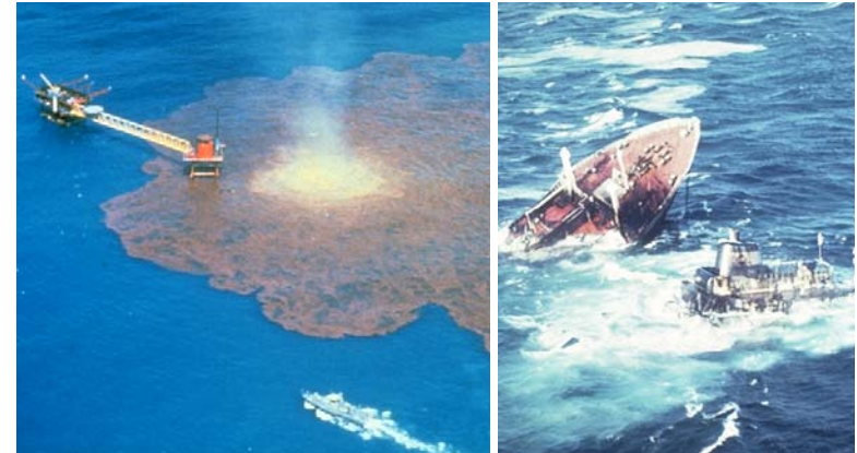
Offshore oil wells and oil tankers have both been involved in large oil spills in the past.

The work done by oil rigs always carries the risk of leaks and explosions. Fires, mechanical failures, and severe weather such as hurricanes can cause accidents at any time. Explosive natural gas often bubbles up from oil wells. If a natural gas cloud reaches the surface, a single spark can touch off a huge explosion. In addition, oil can leak from underwater pipes that carry oil from offshore wells to refineries on land.