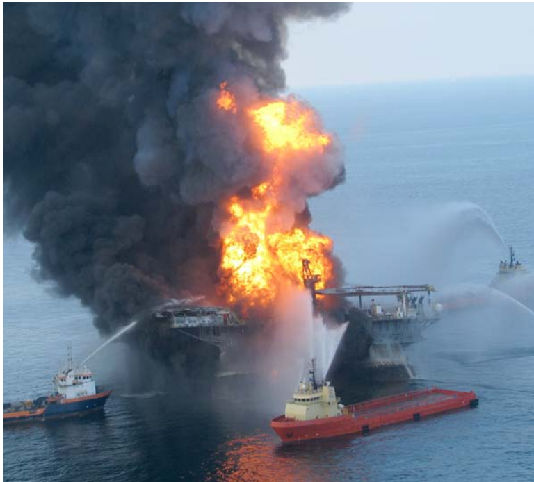
Fireboats battled the blaze aboard the Deepwater Horizon .

Eleven of the 126 rig workers died in the explosion. The others were rescued by nearby ships, and the injured were flown to a hospital in Alabama. For two days, ships attempted to put out the flames by spraying huge amounts of water onto the massive oil rig. But on April 22, 2010, a second explosion sent the Deepwater Horizon to the bottom of the ocean. The loss of life, the injuries, and the destruction of the oil rig were a major disaster. But at the time of the accident and in the days that followed, no one knew just how serious the disaster would become.