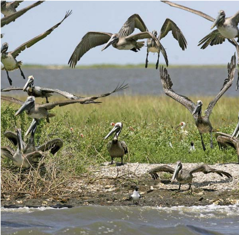
Rare birds such as these brown pelicans off the Louisiana coast are threatened by the oil spill.

The harmful effects of oil spills become clear when the oil gets close to and reaches the shore. Oil spills can cause tremendous damage to marine life, the environment, and the economy. Countless birds, fish, and other animals can be killed as the oil reaches the areas where they hunt and live. Beaches and wetlands can become contaminated with toxic oil. Wildlife refuges that are home to rare animals can be destroyed.