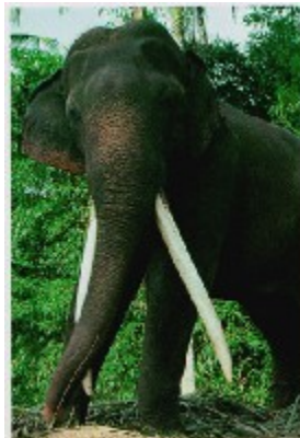
Asian elephants are endangered.

The elephants speak to one another for the same reasons people talk. Sometimes they even shout with excitement. When Shirley first came to the sanctuary, Jenny looked at her and began to roar. Shirley roared back. At first, the animal keepers had no idea what the fuss was about. Later, they discovered that Shirley and Jenny had crossed paths 20 years earlier in a circus. The elephants' roars meant they still recognized each other. They had a lot of catching up to do!